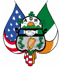
John P. Kelly Division