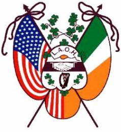
Mother McAuley Division