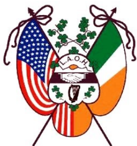
Mother McAuley Division