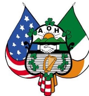
John P. Kelly Division