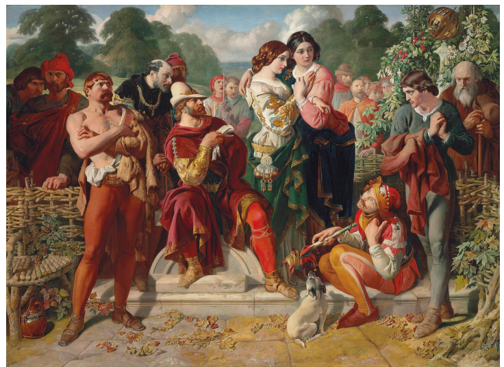
The Wrestling Scene in 'As You Like It' 1854' oil on canvas