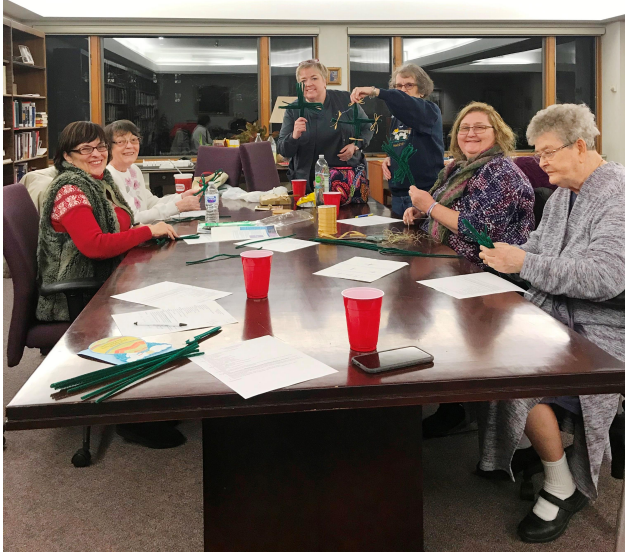
Lucas County LAOH Mother McAuley Division make Brigid's Crosses at their January meeting.

HOME OF THE 2019 STATE OF OHIO AOH ~ LAOH CONVENTION AUGUST 15 ~ 18