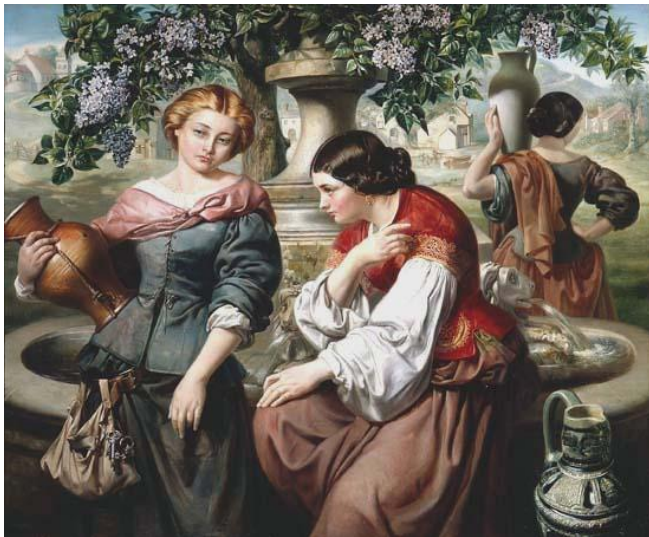
The Village Gossips (England, 1857) Oil on panel

He is perhaps best remembered for his monumental history paintings, including the frescos and oil works completed as part of the House of Lords Commission between 1859 and 1864. Working on these frescos put a great strain on his health, however, in his later years he continued working on scenes from the works of Shakespeare, as well as being actively involved in the RA. He died 25 April 1870 of acute pneumonia and is buried at Kensal Green cemetery, London.