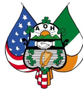
John P. Kelly Division