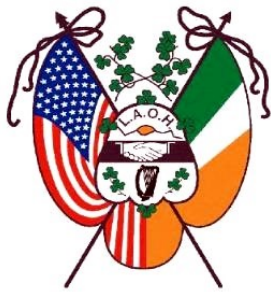
Mother McAuley Division