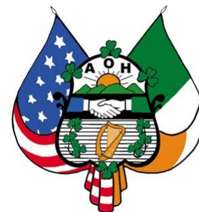
John P. Kelly Division