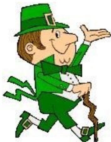
BORDERLINE GENIUS, LLC