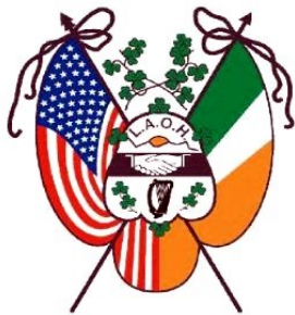
Mother McAuley Division