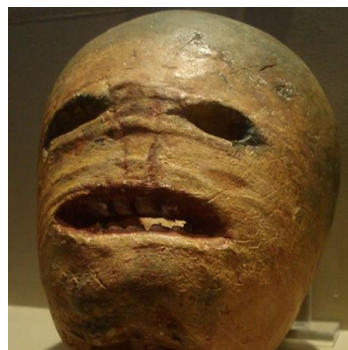
An original Irish Jack-O-Lantern

On all Hallow's eve, the Irish hollowed out Turnips, rutabagas, gourds, potatoes and beets. They placed a light in them to ward off evil spirits and keep Stingy Jack away. These were the original Jack O'Lanterns. In the 1800's a couple of waves of Irish immigrants came to America. The Irish immigrants quickly discovered that Pumpkins were bigger and easier to carve out. So they used pumpkins for Jack O'Lanterns.