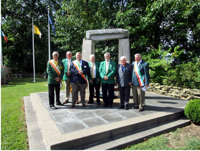
AN GORTA MOR MASS SEPT. 15, 2019